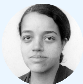
Dorothy Vaughan (1910 - 2008) First African-American NASA supervisor