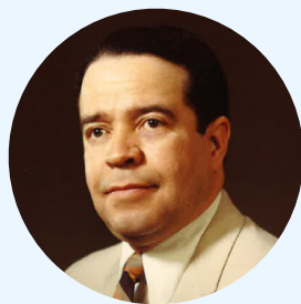
Jesse Ernest Wilkins Jr. (1923 - 2011) President of the American Nuclear Society and a Professor at Harvard. He started his Ph.D. at age 13 and finished it at age 19.

Each year in February, as part of Black History Month, several initiatives invite us to celebrate and highlight the contribution of black people in our society. IVADO and OBVIA wanted to highlight some inspiring profiles that have contributed throughout history up to this day, to various fields related to digital intelligence.