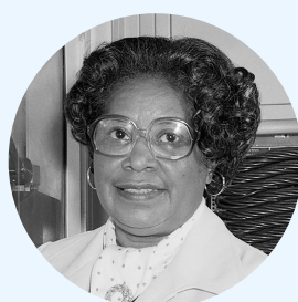
Mary Jackson (1921 - 2005) Hired as a "human computer" she was NASA's first African-American woman engineer.