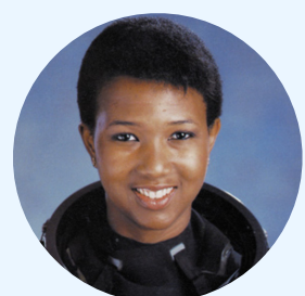
Mae C. Jemison (1956 - ) Brilliant American engineer, physician, professor and NASA astronaut.