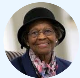
Gladys Mae West (1930 - ) American mathematician known for her contributions to satellite positioning systems.