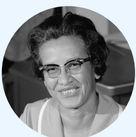
Katherine Johnson (1918 - 2020) Hired as a "human computer" at NASA, worked on calculations for the Apollo mission.